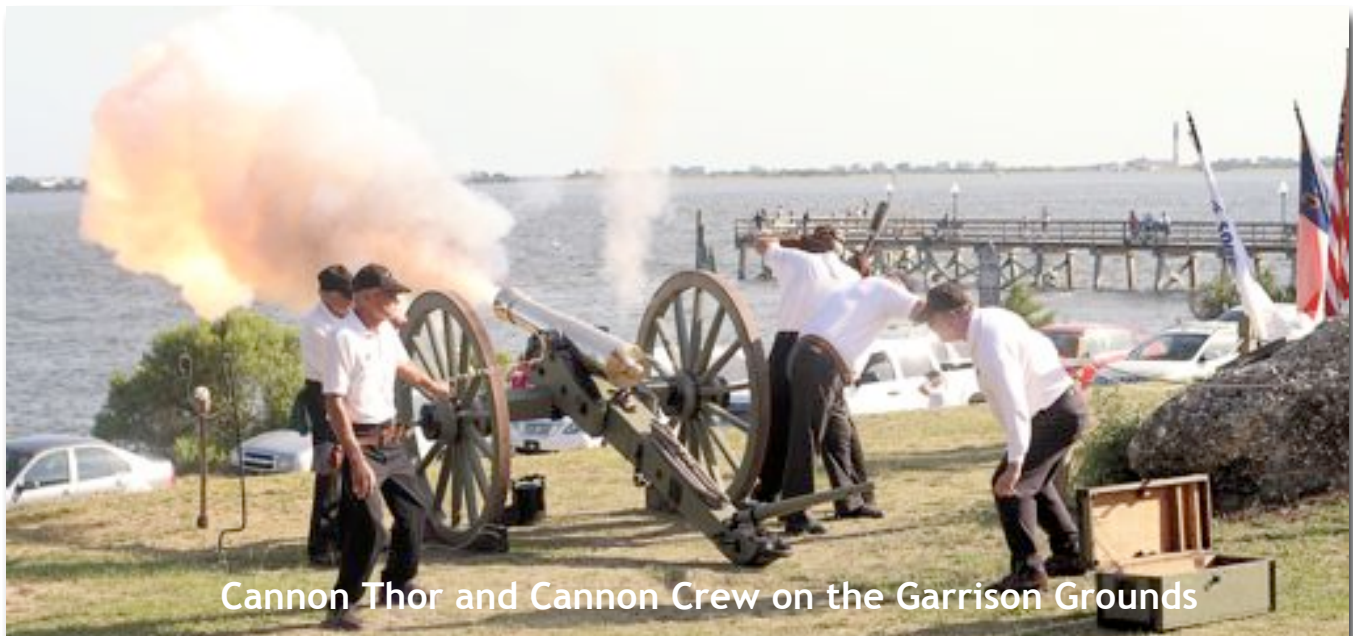
Cannon Thor and Cannon Crew on the Garrison Grounds

We really need some volunteers a few hours a month to greet visitors and answer questions. I will give you information about things that might be asked, but the captions on the exhibits cover nearly everything. You will meet some fascinating people from all over the country, and some from other nations. If you would like to help us out, please call me at 477-0296.