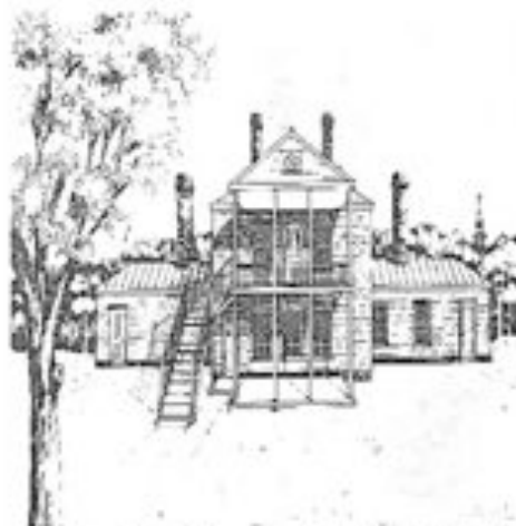
Fort Johnston Officers' Quarters